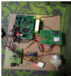
Fig : Entire Kit