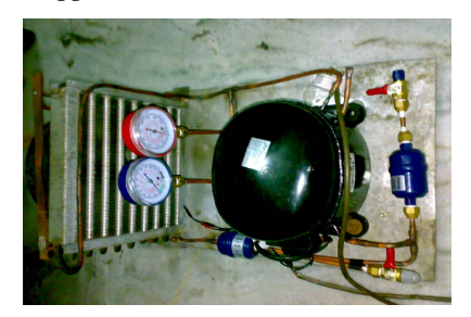
Refrigerant Recovery Unit

Refrigerant recovery system is used when a system that leaks may be topped-up or repaired. Topping-up may have a lower immediate cost, whereas repairing the leak takes more time and therefore costs more. However, in the long-term, the repaired system is less likely to leak thus the costs cease, whereas repeatedly topping-up a system over months and years results in a very high accumulated cost. Obviously, preventing leakage and thus fewer journeys to the equipment and better resulting efficiency is much more desirable from an environmental perspective. It is very useful in industrial applications.