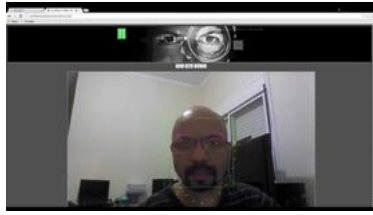
Fig.4.1. Face recognition.